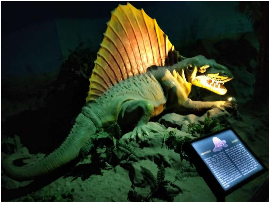
7. A exhibit of Dinosaur from Pre-historic life gallery.