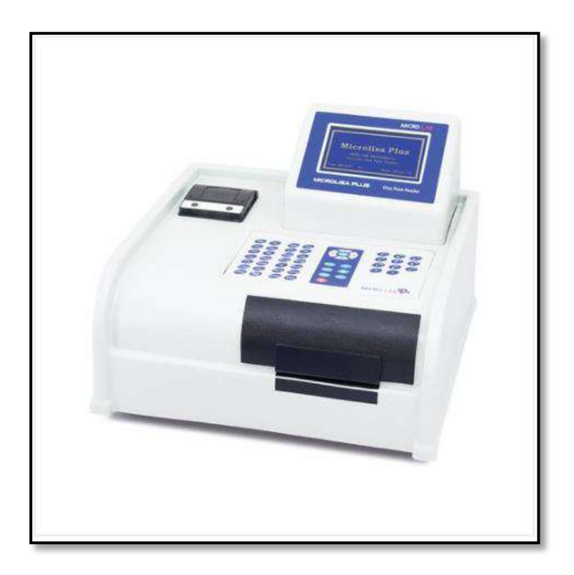
Elisa Microplate Reader