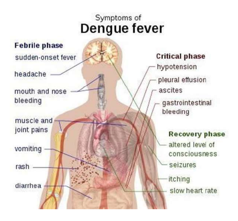
Symptoms of Dengue

Dengue fever is a mosquito- borne tropical disease caused by the dengue virus ( Flavivirus ). Dr Khanna told us almost every other person who is suffering from fever and headache could be having Primary dengue and Silent Dengue . However, it is the Secondary dengue which is severe and problematic. This occurs due to several serotypes of the virus. After Primary Dengue the antibodies formed should help to fight the virus but they hide the virus when they attack the second time.