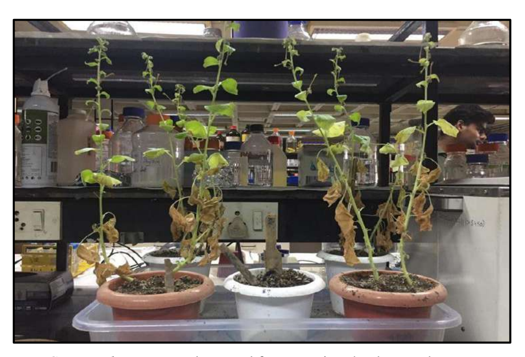
Cissampelos pareira plant used for preparing the dengue drug