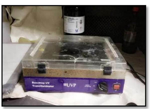
UV- trans illuminators

UV- trans illuminators are used in molecular biology labs to view DNA (or RNA) that has been separated by electrophoresis through an agarose gel. During or immediately after electrophoresis, the agarose gel is stained with a fluorescent dye which binds to nucleic acid. Exposing the stained gel to a UVB light source causes the DNA/dye to fluoresce and become visible. This technique is used wherever the researcher needs to be able to view their sample, for example sizing a PCR product, purifying DNA segment after a restriction enzyme digest, quantifying DNA or verifying RNA integrity after extraction.