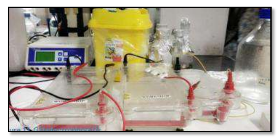
Apparatus of agarose gel electrophoresis

Gel electrophoresis is a method for separation and analysis of macromolecules (DNA, RNA and proteins) and their fragments, based on their size and charge. It is used in clinical chemistry to separate proteins by charge or size (IEF agarose, essentially size independent) and in biochemistry and molecular biology to separate a mixed population of DNA and RNA fragments by length, to estimate the size of DNA and RNA fragments or to separate proteins by charge.